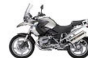
Titanium Silver Metallic

An UNSTOPPABLE machine that offers unlimited freedom to the rider. It is equally serene on tarmac and rough terrain alike – so now the only restriction on your touring is how homesick you get. It features an upgraded drive train, an even more expressive design, and, for the first time, the Enduro ESA suspension option. The BMW R 1200 GS – because even the most free of spirits need something to rely on.