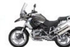
Slate Matt Metallic