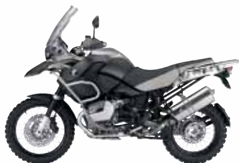
Magnesium Matt Metallic